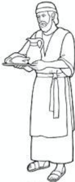
The King's servant