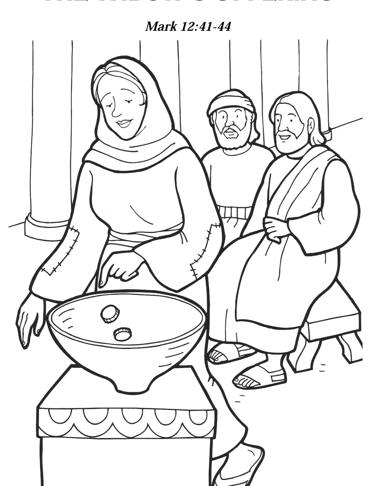
The widow gave her last two coins